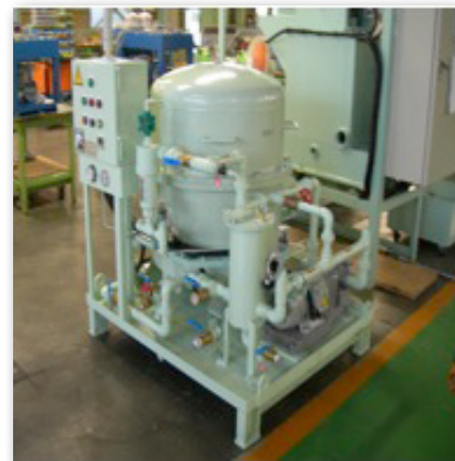
CS-SS315-1RQ at Suzuki Manufacturing