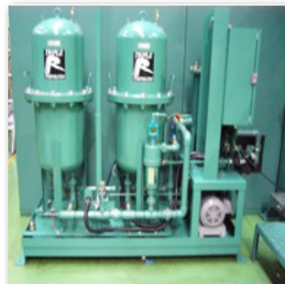
CS-SS306-2RQ at Volvo Korea