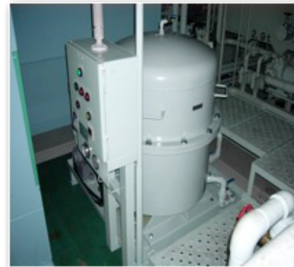
CS-SS315-1RQ at Komatsu Engineering